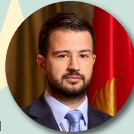
Jakov Milatović , President of Montenegro

Jakov Milatović was born in Podgorica on December 7, 1986. He completed primary, secondary school and faculty in Podgorica. As a US government scholarship holder, he spent one academic year at Illinois State University. After that, he spent one semester at Vienna University of Economics and Business (WU Wien) as a scholarship holder of the Austrian Government. Under the auspices of the European Commission, he spent one year of study at La Sapienza University in Rome. He earned his master's degree in the field of economics at the University of Oxford and he was also awarded a scholarship by the British Government.