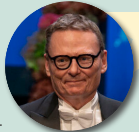
James A. Robinson , University of Chicago, Nobel Prize Winner 2024

James A. Robinson is a British-American political scientist, economist, and winner of the 2024 Nobel Prize for Economics (together with Daron Acemoglu and Simon Johnson) "for studies of how institutions are formed and affect prosperity." His work explores the underlying causes of economic and political divergence both historically and today and uses both the mathematical and quantitative methods of economics along with the case study, qualitative and fieldwork methodologies used in other social sciences. Robinson has a particular interest in sub-Saharan Africa and Latin America and is a Fellow at the Institute of African Studies at the University of Nigeria at Nsukka. He taught a summer school at the University of the Andes in Bogotá between 1994 and 2022. He has published three books co-authored with Daron Acemoglu, an Institute Professor of Economics at MIT: Economic Origins of Dictatorship and Democracy , Why Nations Fail: The Origins of Power, Prosperity, and Poverty (translated into 41 languages since its publication in 2012), and The Narrow Corridor: States, Society and the Fate of Liberty . He currently holds appointments in the Harris School of Public Policy and the political science department at the University of Chicago.